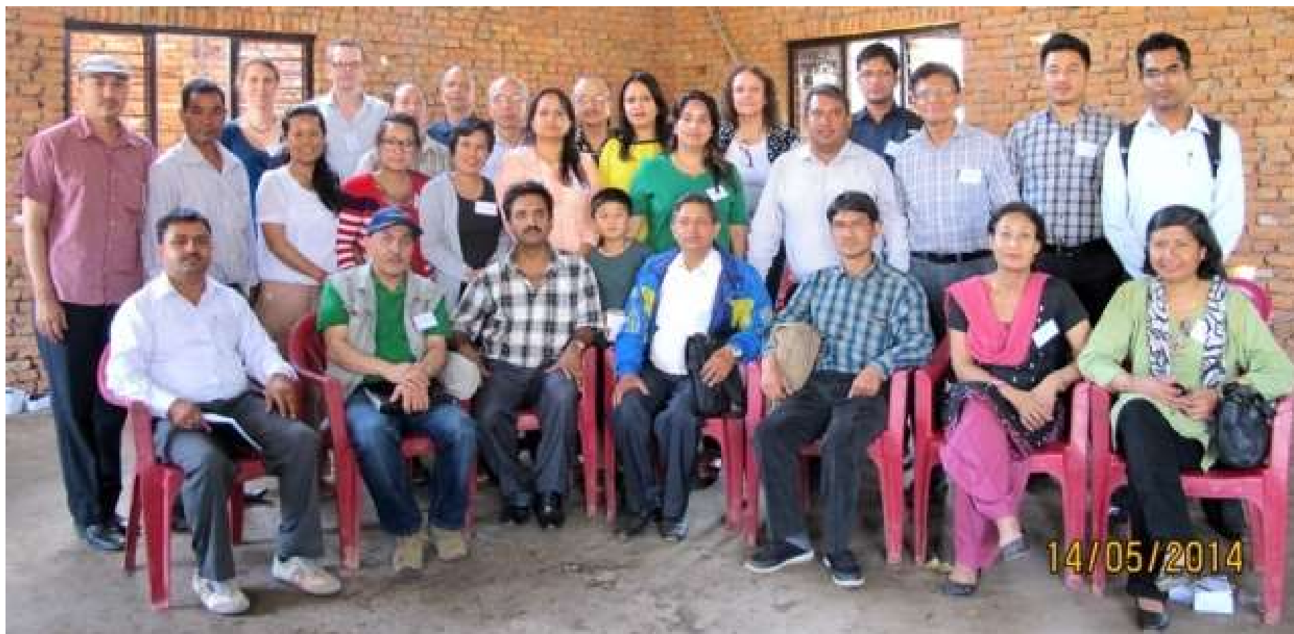
CALIDENA Workshop Nepal May 13 - 15, 2014, Kathmandu